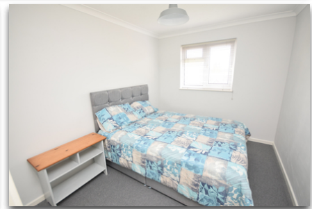
70 St Peters Gardens, Wrecclesham, Farnham, Surrey. GU10 4QY. Fixed Price £215,000