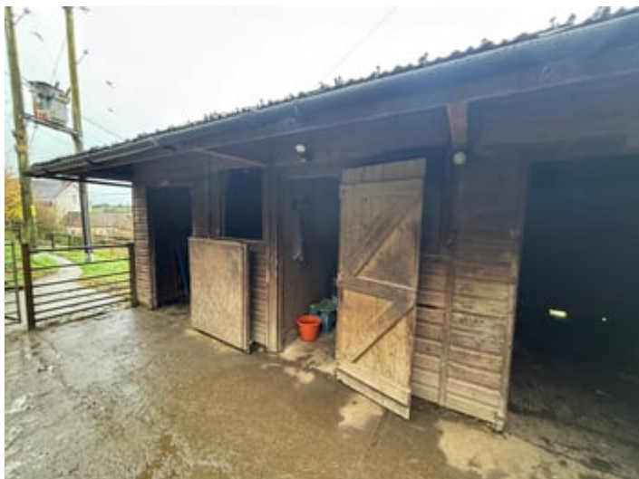
STABLE BLOCK (SECOND IMAGE)