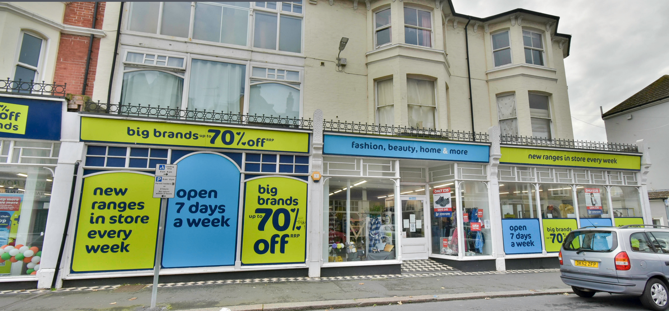
Flat 7, 8-12 St Margarets Court, St Leonards Road, Bexhill-on-Sea, East Sussex TN40 1HN