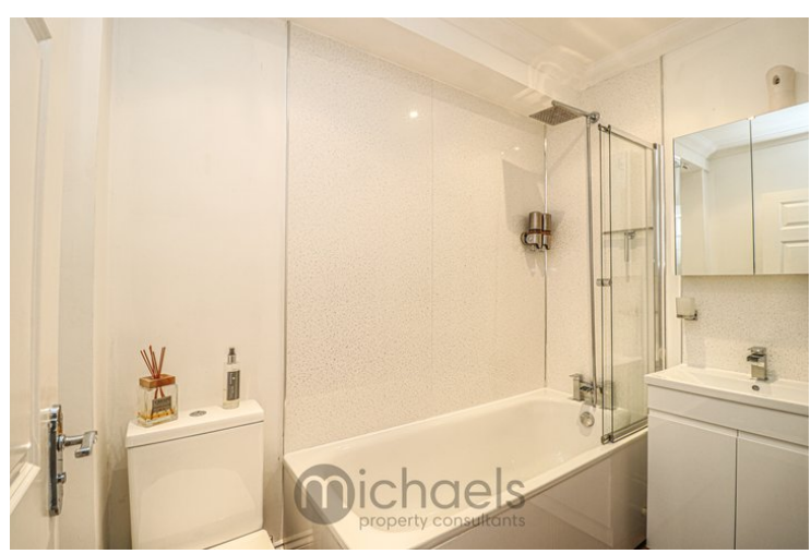
With heated towel rail, close coupled WC, wash hand basin, panelled bath with shower screen and rainfall shower.