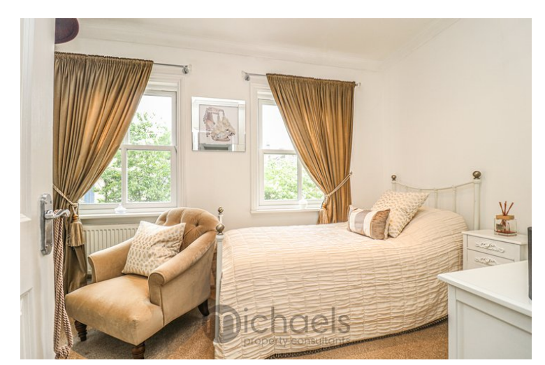
13'5" \times 8'1" (4.09m x 2.46m) With two double glazed windows to rear, radiator, fitted wardrobes.