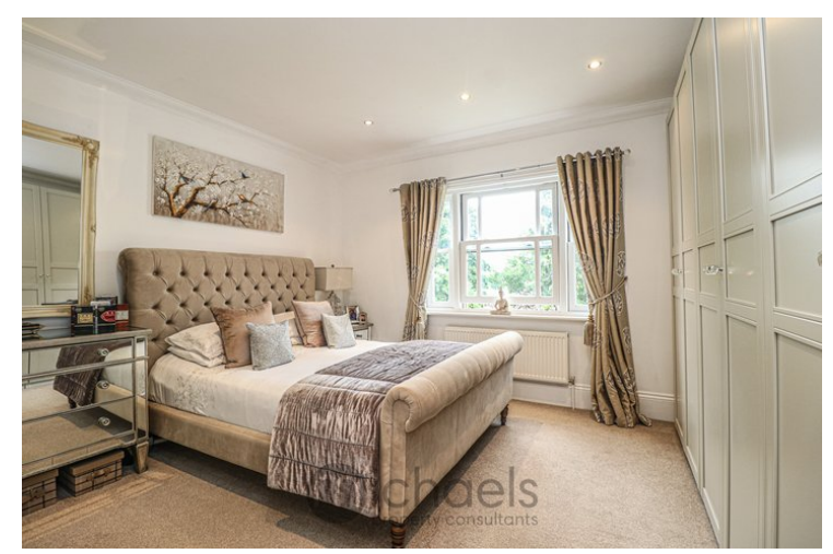
13'5" \times 11'6" (4.09m x 3.51m) With double window to front, radiator, fitted wardrobes, door to en-suite.