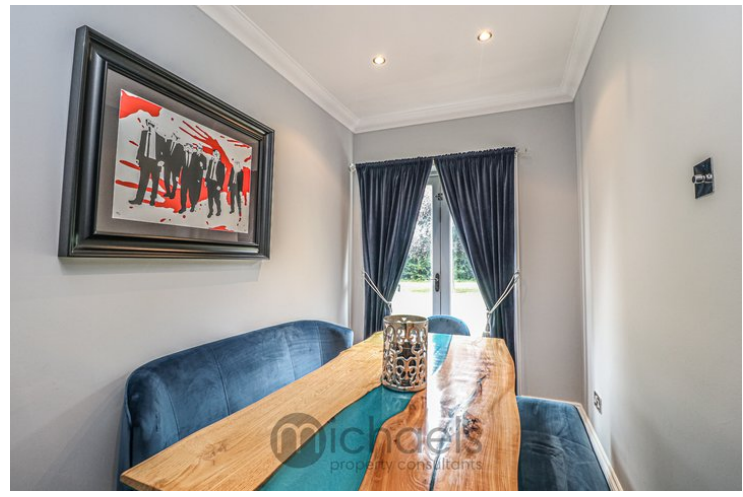
11'7" \times 6'0" (3.53m \times 1.83m) With double glazed French doors to front, radiator.