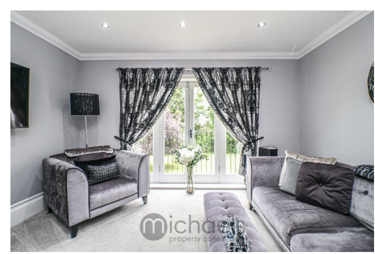
13'5" \times 12'2" (4.09m x 3.71m) With double glazed French doors to front providing access to the Juliet balcony, radiator, TV point.