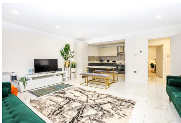
DINING LOUNGE AREA

KITCHEN Fitted kitchen incorporating an inset sink unit with mixer tap, complementary worksurfaces and upstands, four ring electric hob with extractor hood above and oven below, integrated dishwasher and washing machine, integrated fridge and freezer, ceiling spotlights and high gloss tiled flooring.