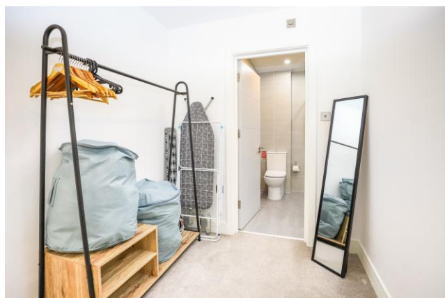
DRESSING AREA TO EN-SUITE

EN-SUITE SHOWER ROOM (6'5 max x 6'2 max) Three piece suite comprising corner shower cubicle, low level WC and vanity unit wash hand basin. Touch-light mirror, chrome towel rail radiator, tiled walls, tiled flooring and ceiling spotlights.