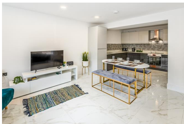
DINING LOUNGE AREA