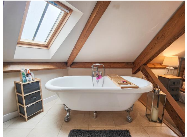
BEDROOM WITH BATHING AREA