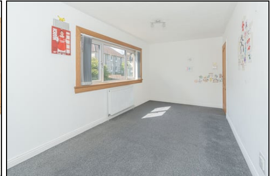
2.9m x 3m (9' 6" x 9' 10")