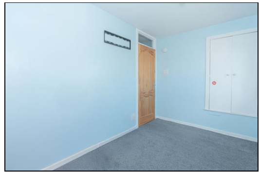
2.6m x 5m (8' 6" x 16' 5")