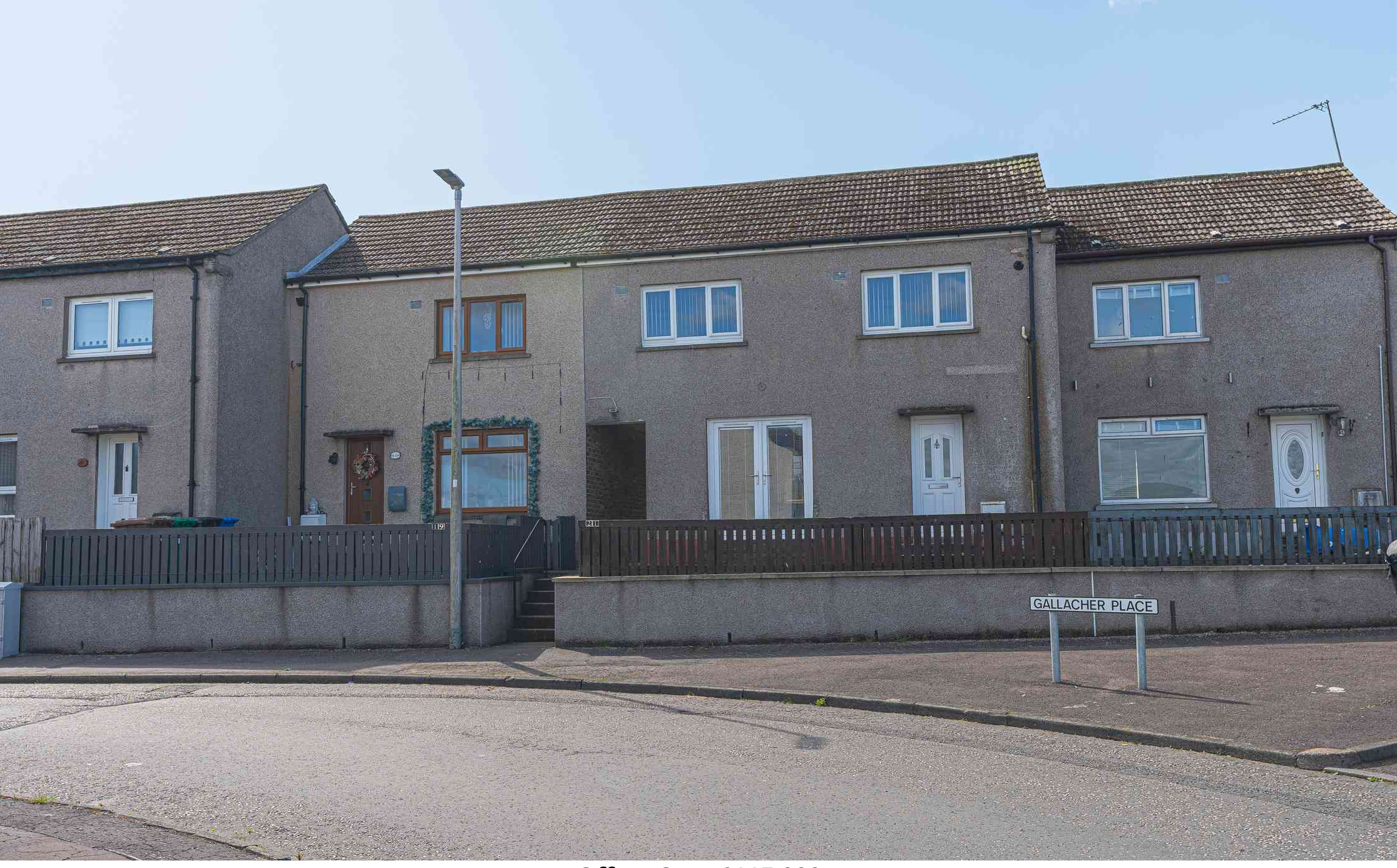
Offers Over £115,000 21 Gallacher Place, Lumphinnans, Cowdenbeath, Fife, KY4 9HP