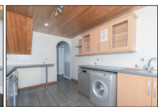
2.7m x 3.9m (8' 10" x 12' 10")