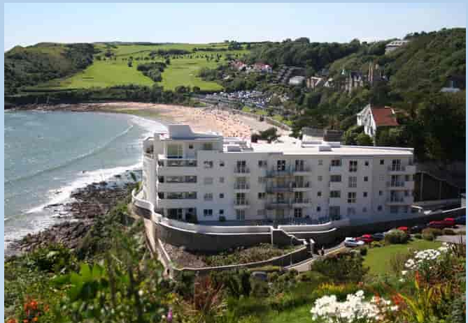
29 Camona Drive, Swansea, West Glamorgan, SA1 1YJ, 01792 645566