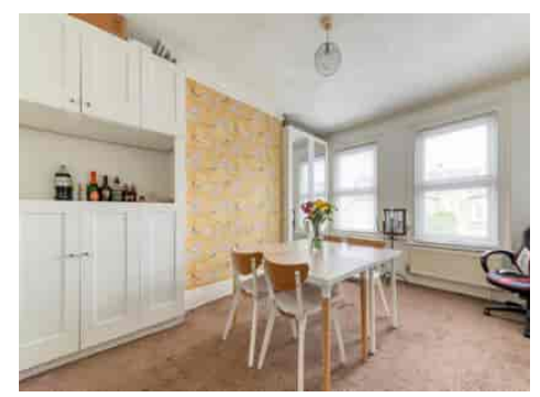
Cameron Road, Croydon, Surrey, CR0 2SR