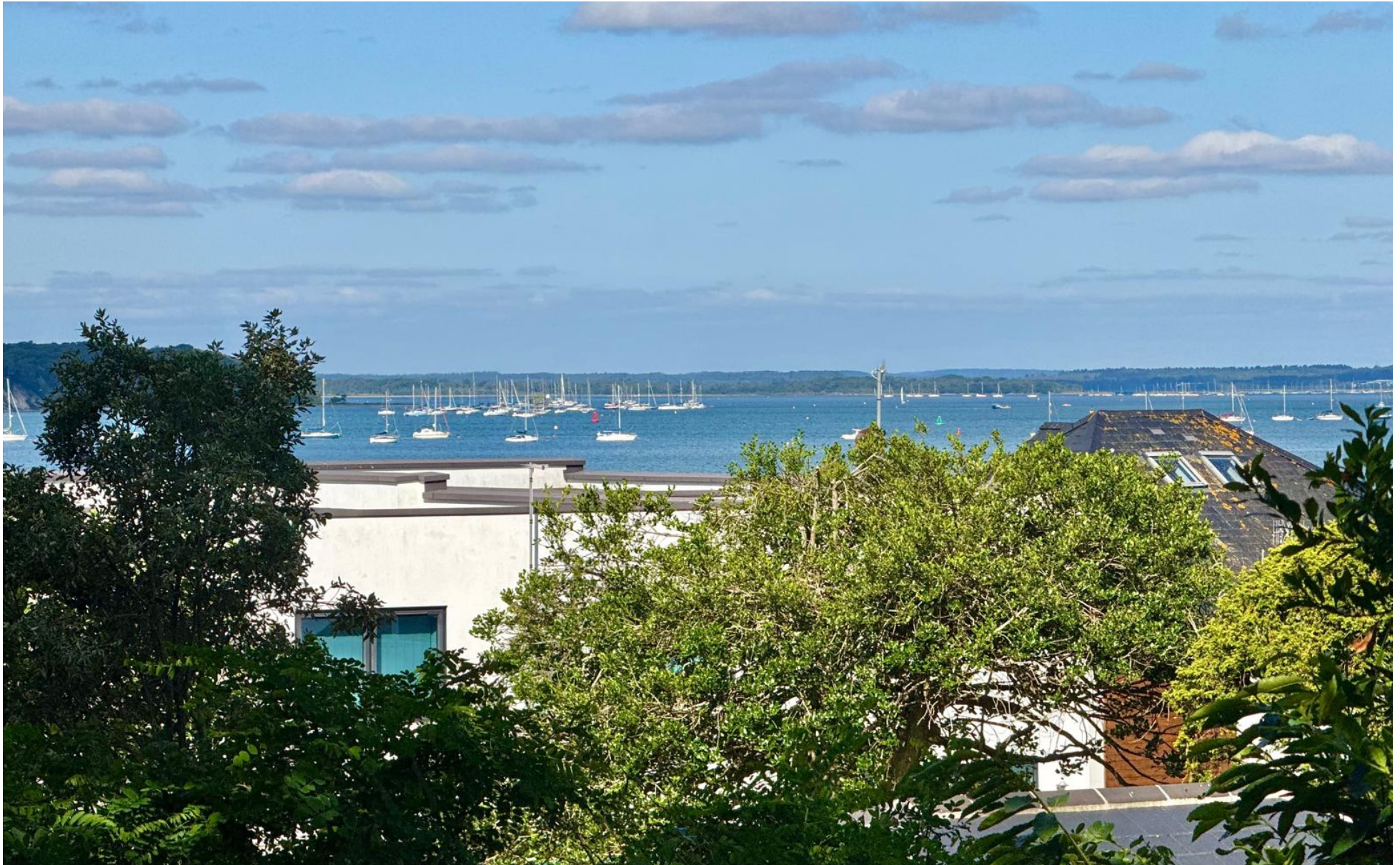
Chaddesley Wood Road, Poole BH13 7PN