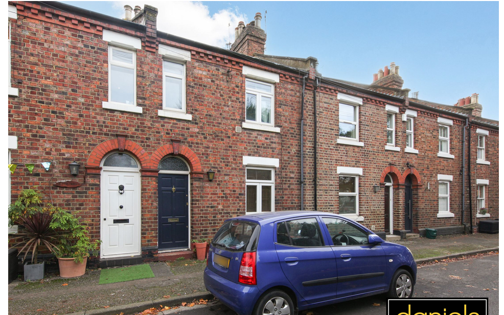
Stephenson Street, Willesden Junction, London NW10 6TX £585,000 - Freehold