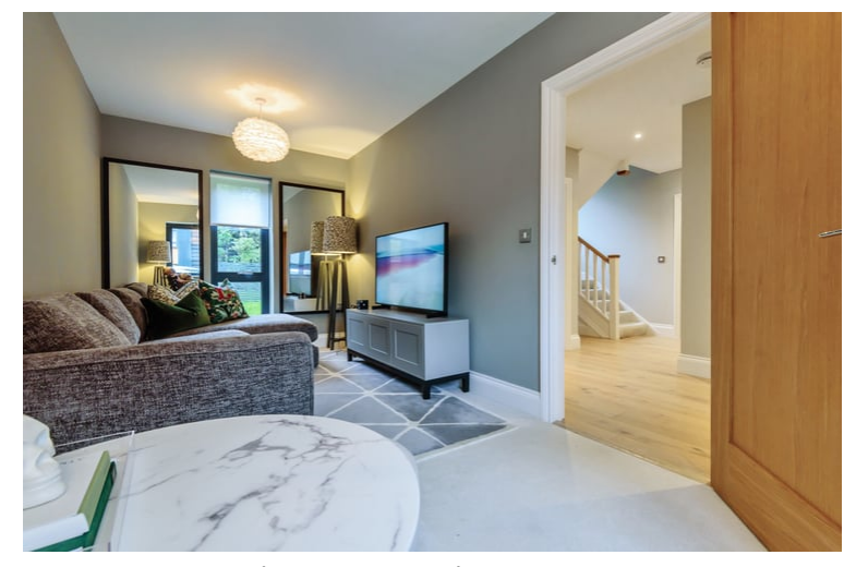
5.26m x 2.44m (17' 3" x 8' 0")

This separate reception room has a double aspect with double glazed windows facing the front and rear aspects.