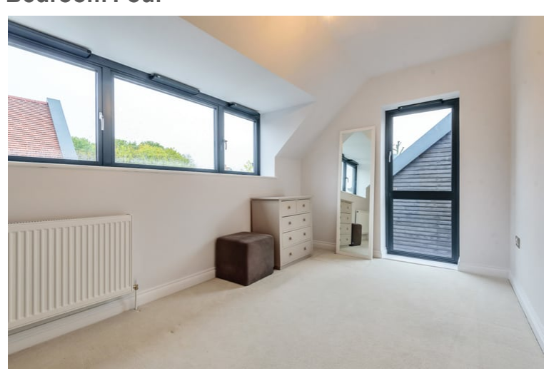
4.27m x 2.57m (14' 0" x 8' 5")

Double glazed windows overlooking the front and side elevations and a radiator.