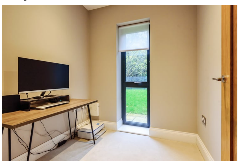
1.93m x 1.80m (6' 4" x 5' 11") Situated at the rear of the property with a double glazed window which overlooks the rear garden. This useful work from home space could also be used as a playroom.