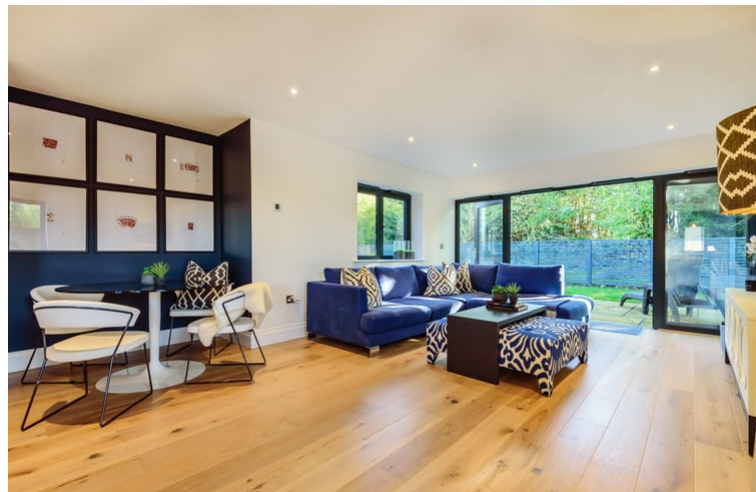
Wooden floors extend throughout, recessed spotlighting, double glazed windows to both the front, rear and side elevations. There is a wide set of

French doors which open directly onto the rear garden.