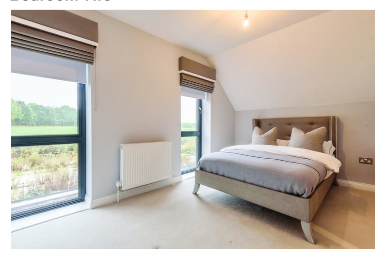
4.11m x 3.02m (13' 6" x 9' 11")

Far reaching countryside views via two double glazed windows that face the side aspect, there is also a radiator,