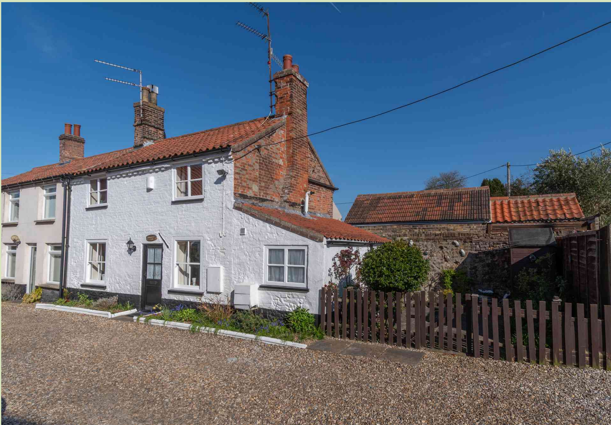
Ashanti, Wells-next-the-Sea Offers in Excess of £400,000