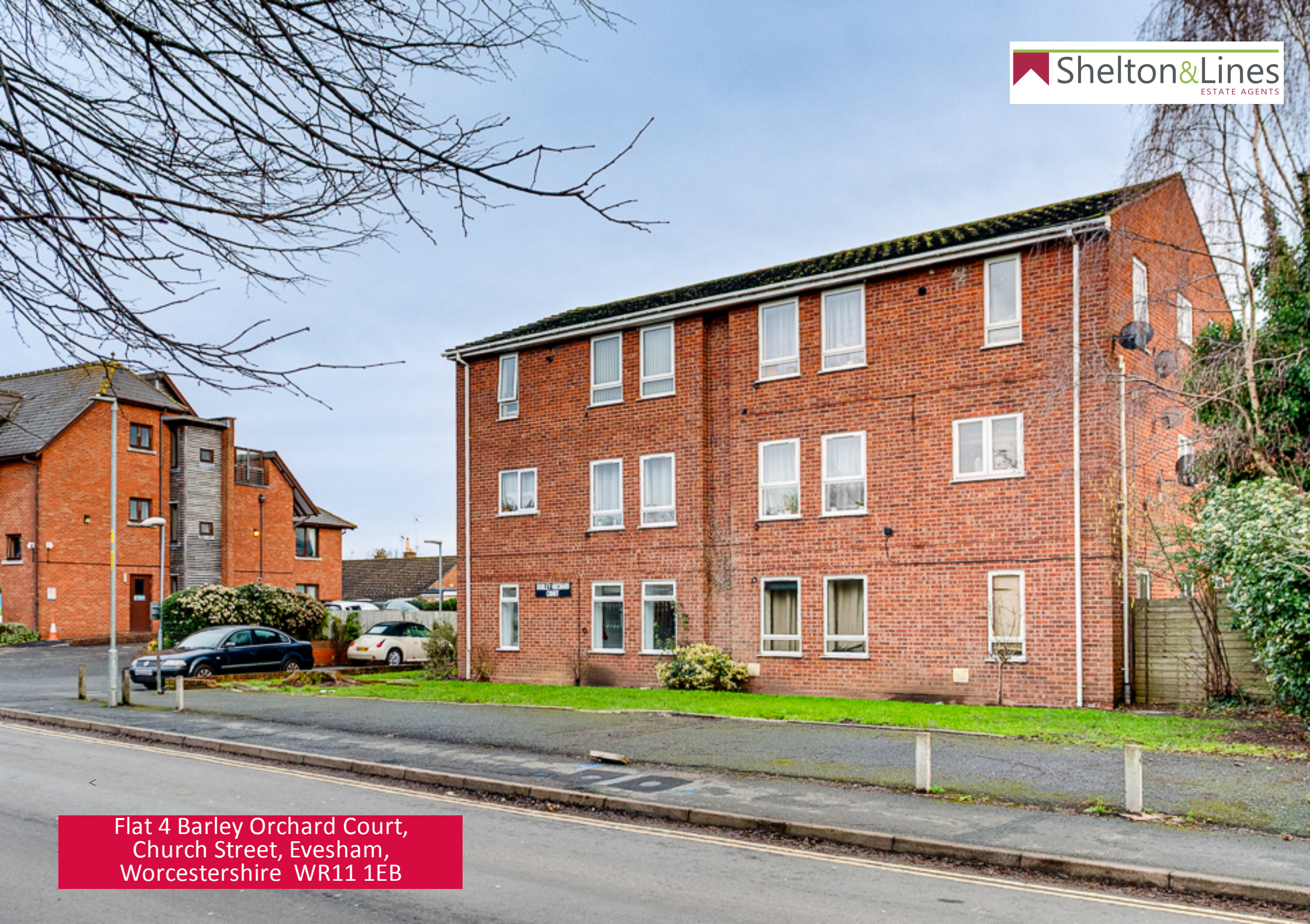
Flat 4 Barley Orchard Court, Church Street, Evesham, Worcestershire WR11 1EB