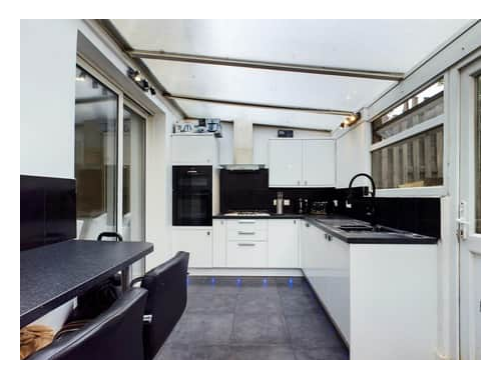
Buller Road, Thornton Heath, Surrey, CR7 8QW