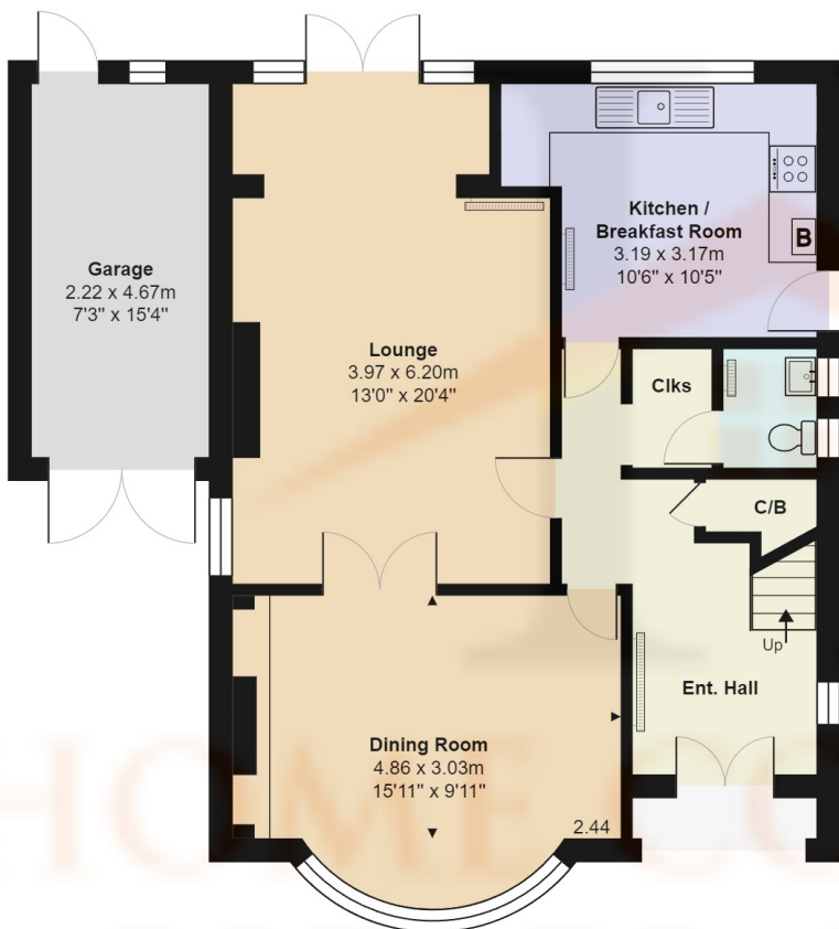
Ground Floor Area: 80.8 m 2 ... 870 ft 2

The property would be well suited for those looking for a home to extend and modernise, and is well placed for schools and transport, with Dame Alice Owens within walking distance, Potters Bar Mainline Train Station for those commuting into town, with fast trains into Kings Cross in just 17 minutes. Pope Paul and Cranbourne Primary Schools are also within walking distance and the M25 and A1M are just a short drive.