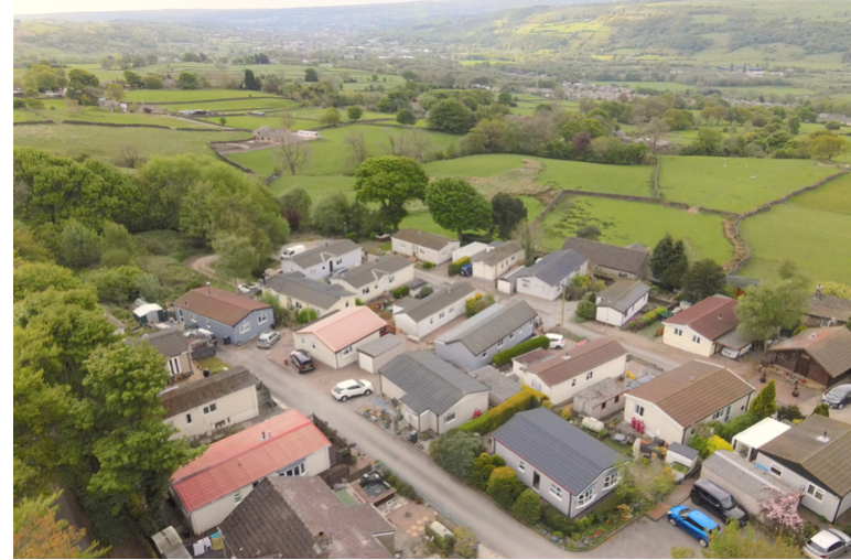
2 High Beck Park, Ilkley Road, Riddlesden, Keighley, West Yorkshire, BD20 5RE