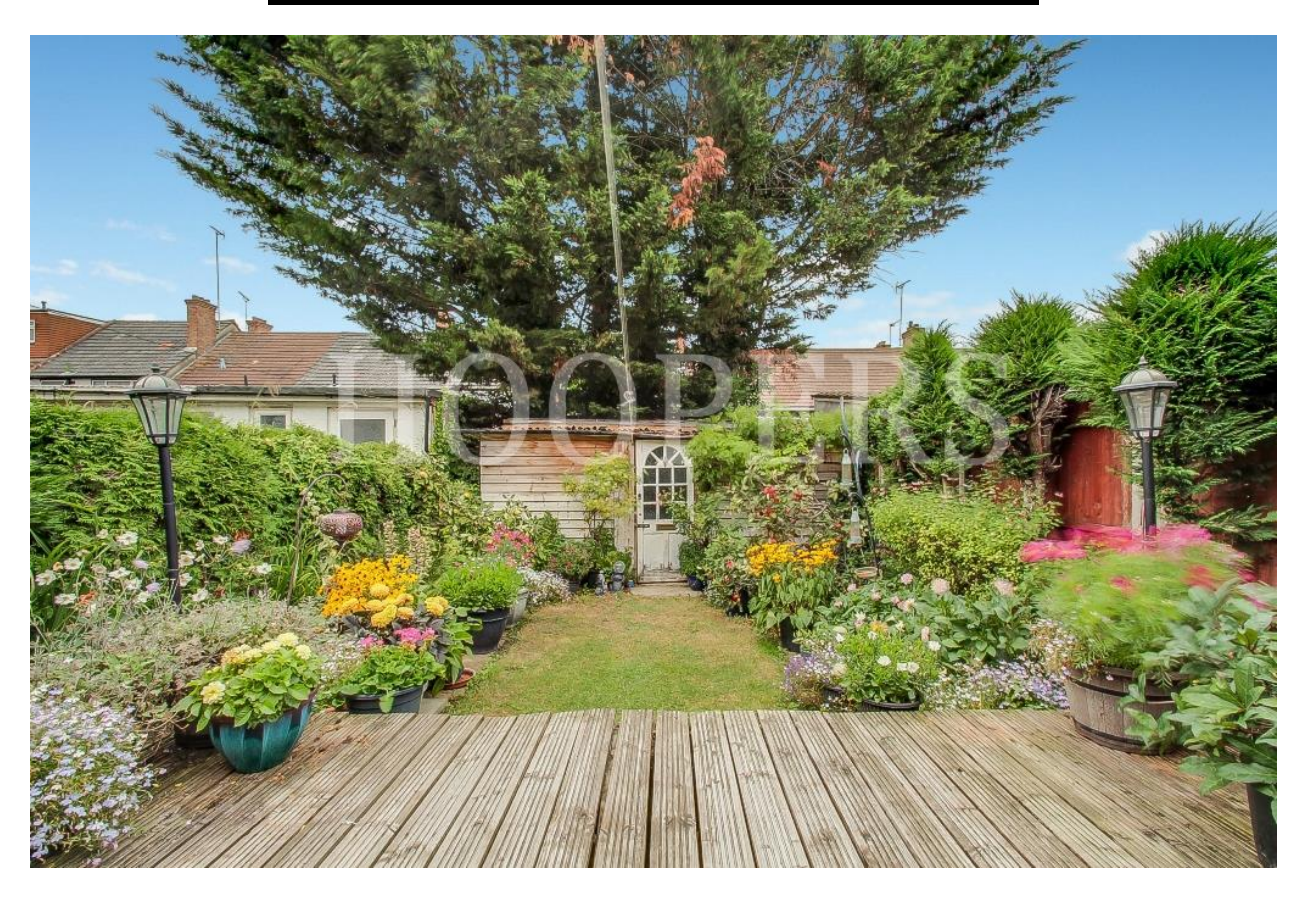
EPC Rating: D

We are pleased to be able to bring to the market an extended centre terrace 1930's built three bedroom family house located in the popular Brentwater Area and situated within a few hundred yards of Crest Road schools and bus services. Benefits include:-