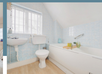
Dragonfield Cottage, Boreham Hill, Boreham Street, East Sussex