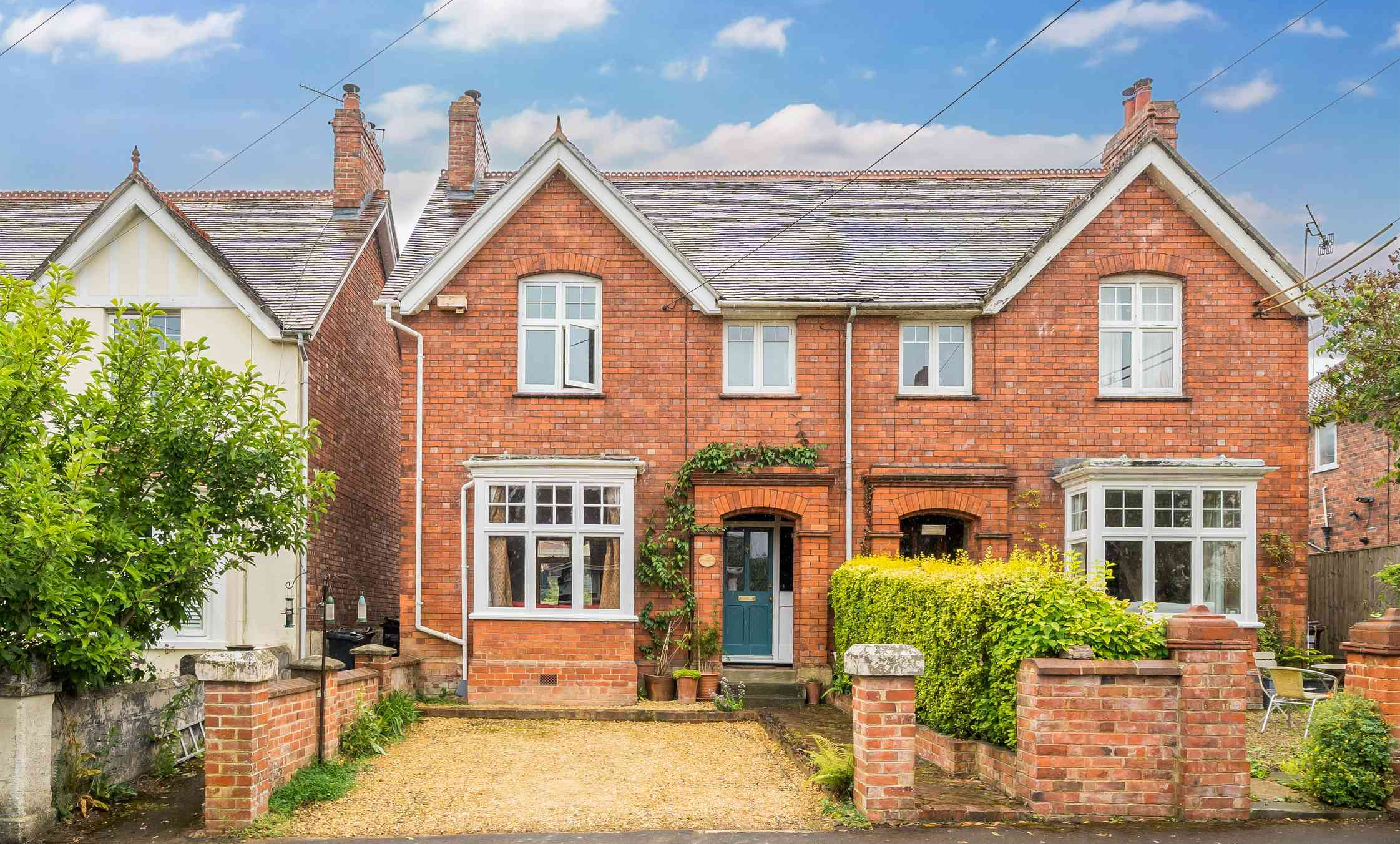
The Present, Frome Park Road, Stroud, Gloucestershire, GL5 3LF Guide Price £635,000