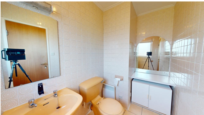
Bedroom with En Suite