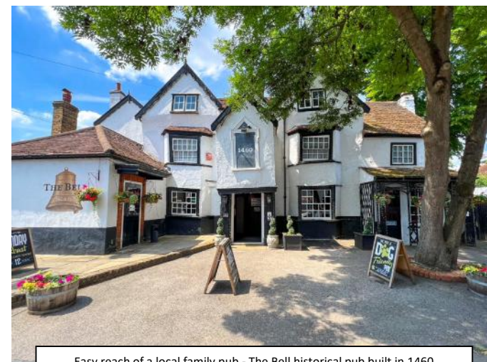
Easy reach of a local family pub - The Bell historical pub built in 1460