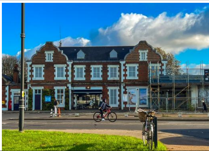
Hampton Court Train Station leading to London, Waterloo – Oyster card, zone 6