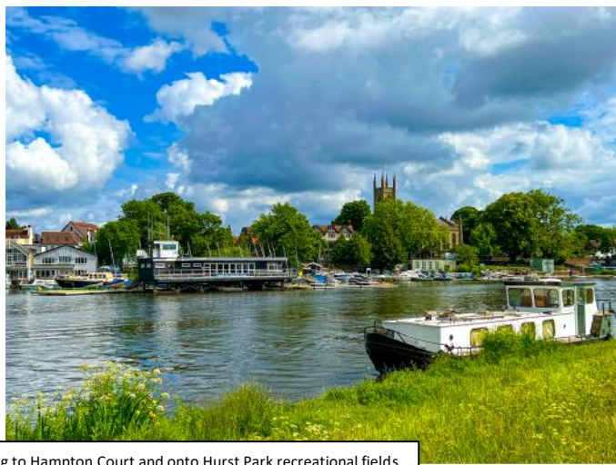
Within easy reach of the River Thames with a pretty foot path leading to Hampton Court and onto Hurst Park recreational fields (Ideal for walking) with wonderful views St. Mary's Church in Hampton with footpath leading up to Hampton Court Place + train station and Walton on Thames