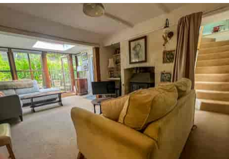
Maycroft, Standard Hill, East Sussex TN33 9NJ