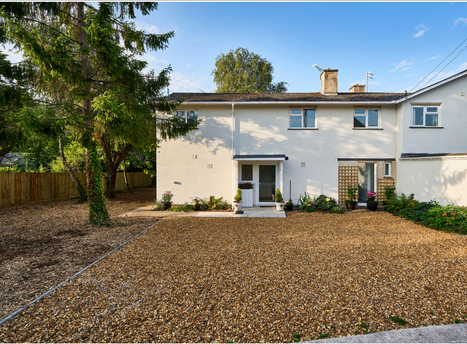
Winsley, Bradford on Avon