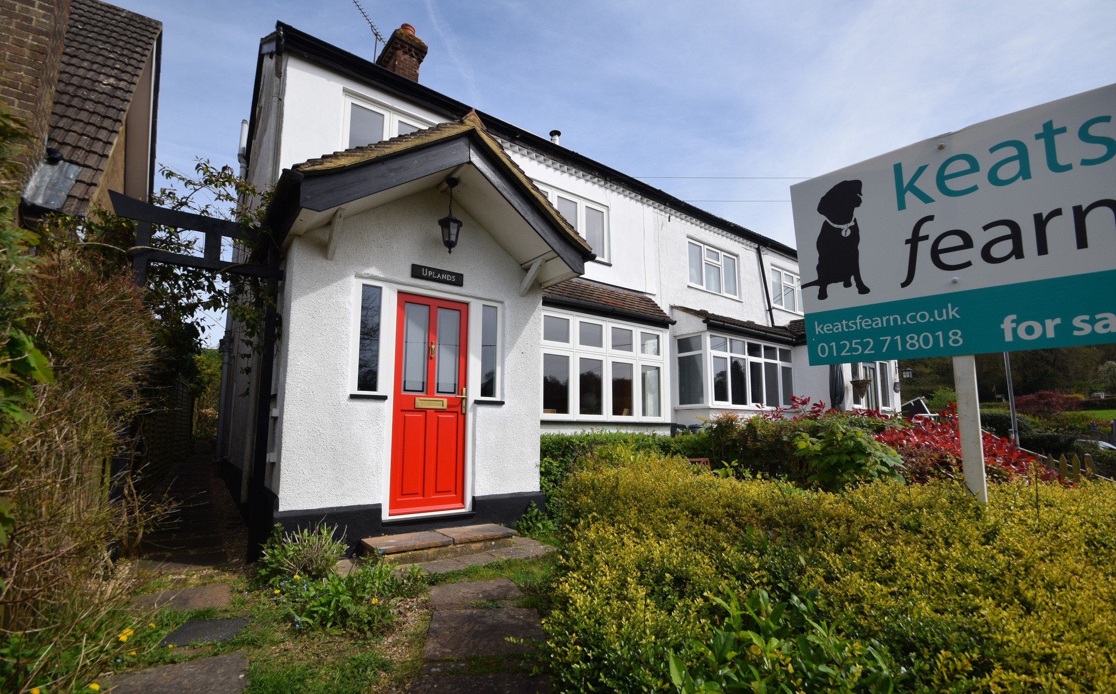
Uplands Church Lane, Ewshot, Farnham, Hampshire. GU10 5BG. Guide Price £550,000