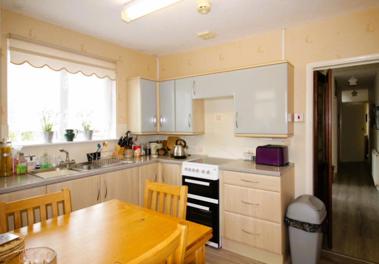
1 Pound Field, Llantwit Major, Vale Of Glamorgan, CF61 1DL

Tel No 01446 794433. E-Mail info@brightermoves.co.uk Web www.brightermoves.co.uk