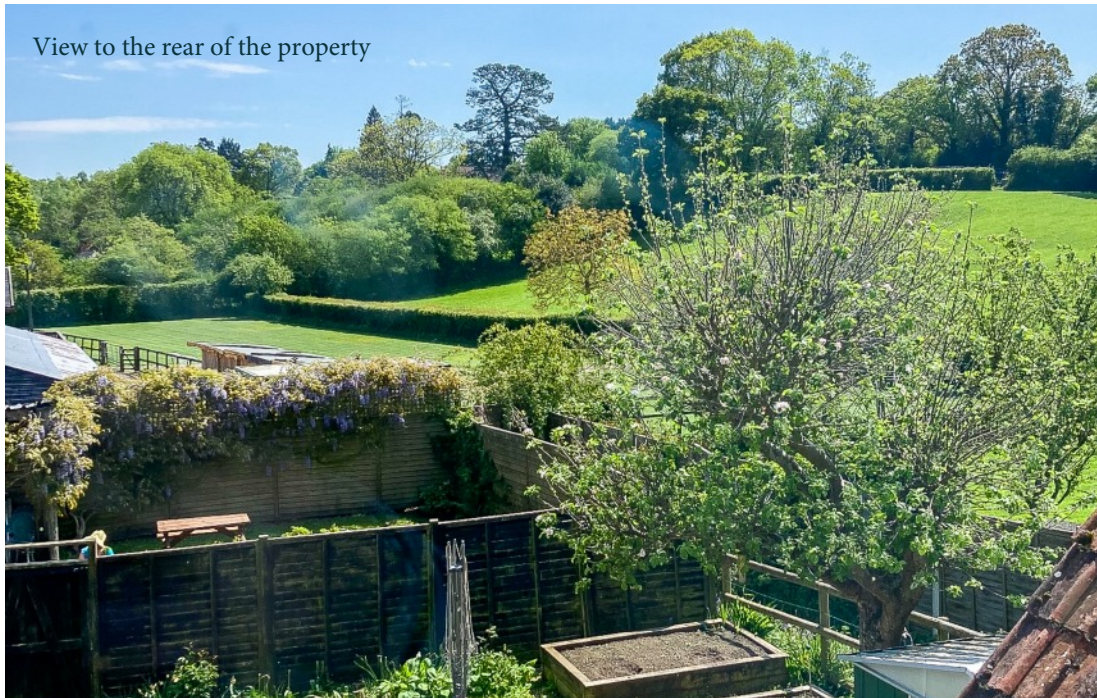
View to the rear of the property