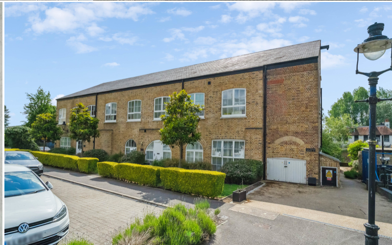
Royal Quay Harefield, Middlesex, UB9 6FH