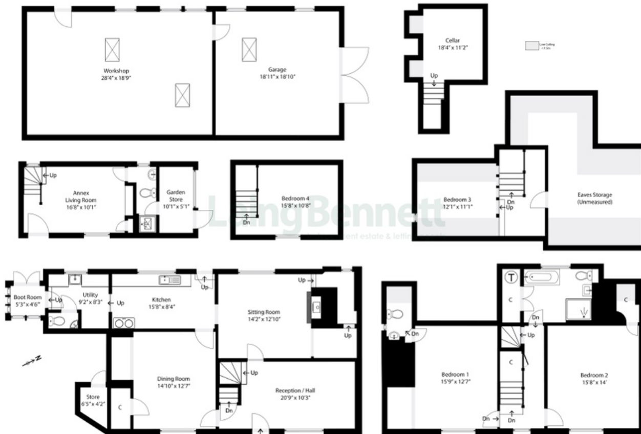
Illustration for identification purposes only. Measurements are approximate. Dimensions given are between the widest points. Not to scale. Outbuildings are not shown in actual location.

Approximate Gross Internal Area (Including Low Ceiling and Cellar, Excluding Eaves and Store) = 226 sq m / 2437 sq ft Annex = 40 sq m / 427 sq ft Workshop / Garage = 84 sq m / 899 sq ft