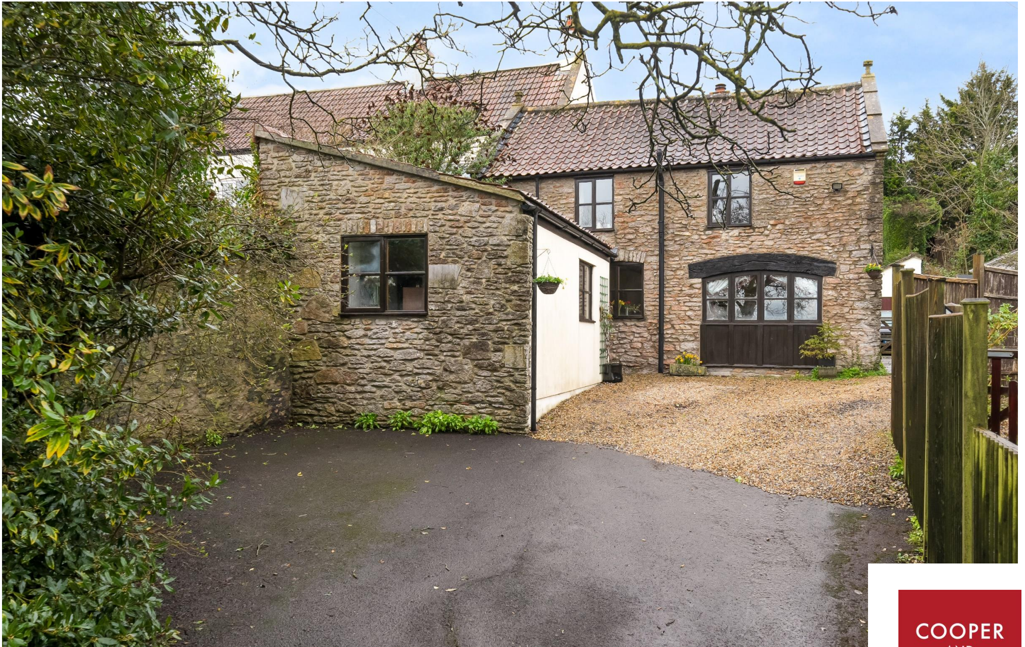
The Coach House, Stoke Road, Westbury-Sub-Mendip, BA5 1HD