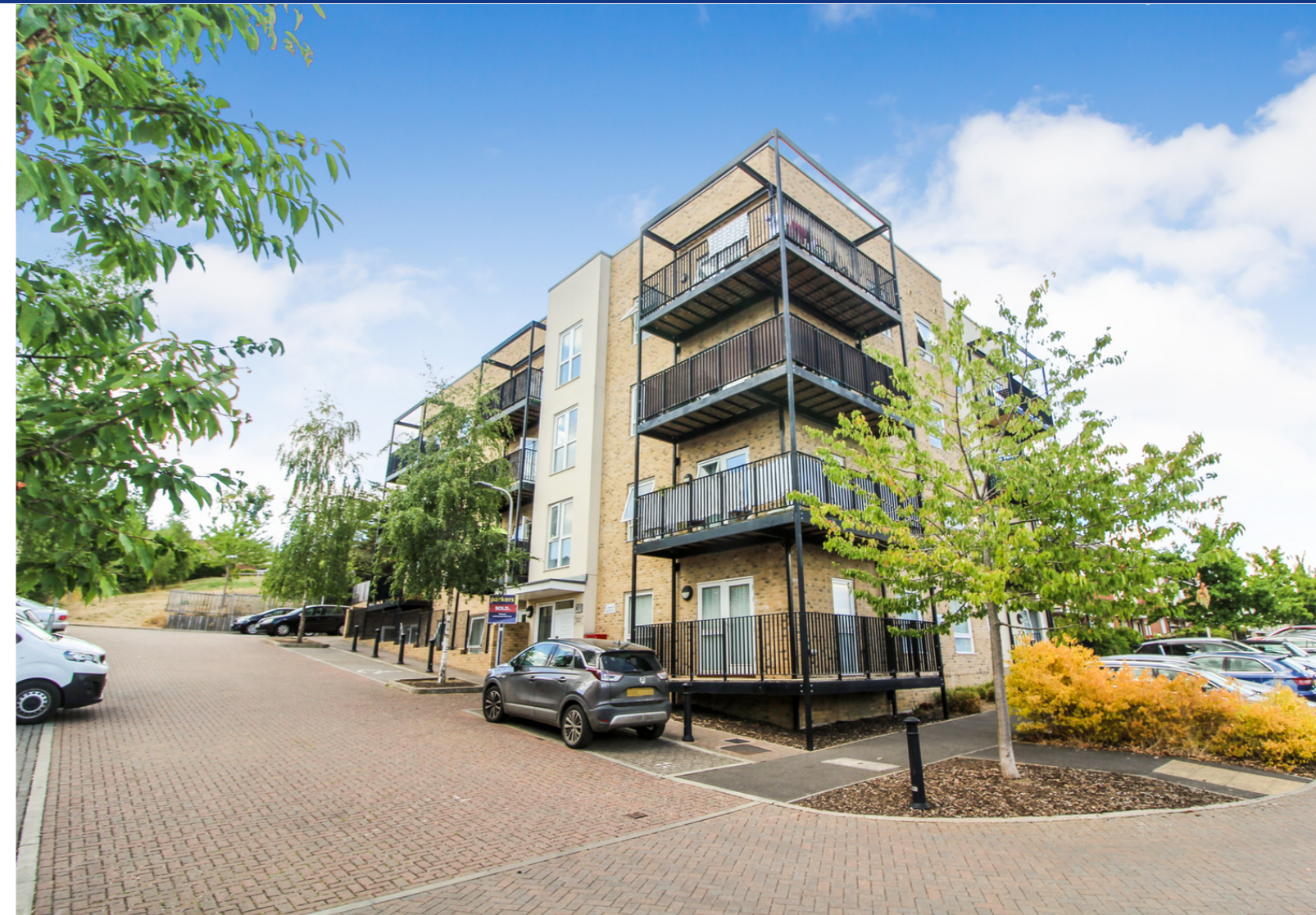
Red Kite House, Deveron Drive, Tilehurst.

Whilst every attempt has been made to ensure the accuracy of the floorplan contained here, measurements of doors, windows, rooms and any other items are approximate and no responsibility is taken for any error, omission or mis-statement. This plan is for illustrative purposes only and should be used as such by any prospective purchaser. The services, systems and appliances shown have not been tested and no guarantee as to their operability or efficiency can be given. Made with Metropix ©2022