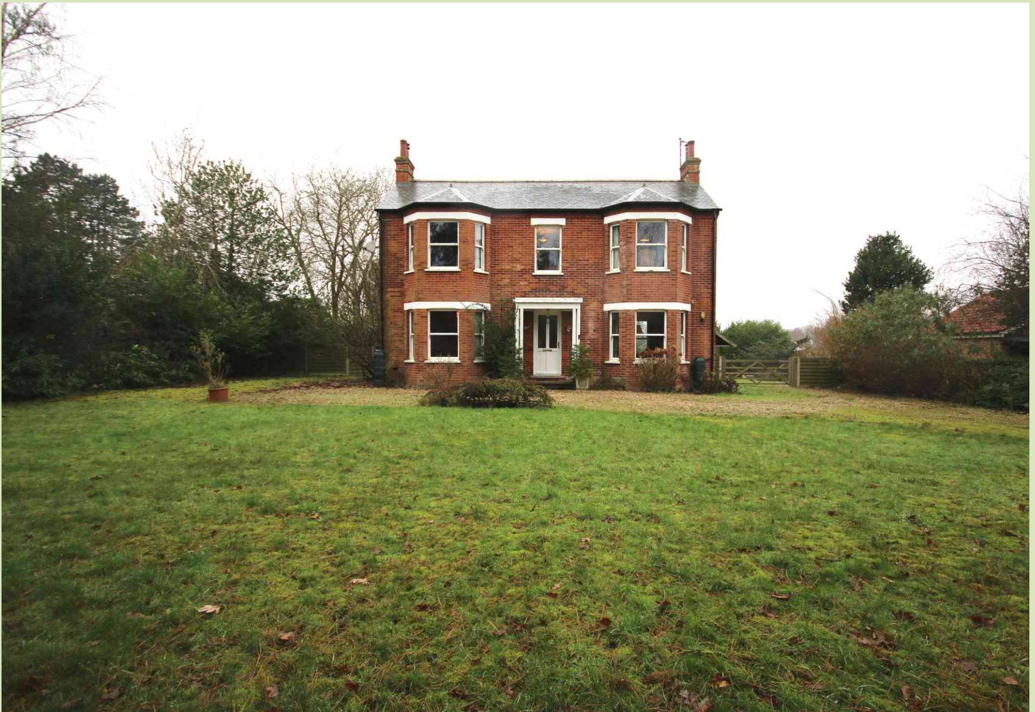
The Birches House, South Wootton Guide Price £750,000