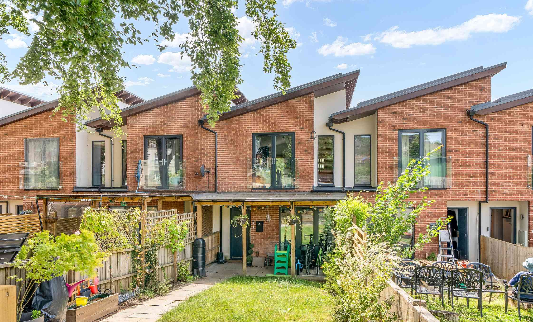
8 The Kitesnest, Bath Road, Stroud, Gloucestershire, GL5 3TA Guide Price £325,000