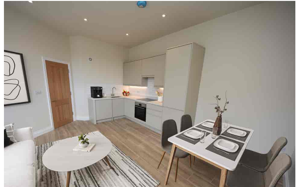
4 The Old Elephant & Castle, Causeway, Banbury, Oxfordshire. OX16 4SN from £237,500 - Share of Freehold