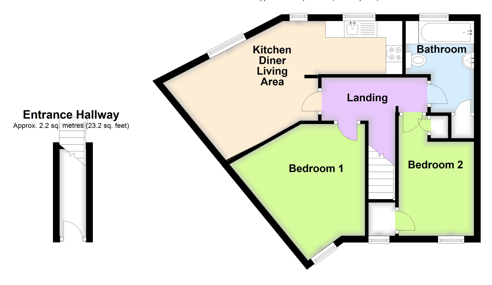
First Floor Approx. 50.2 sq. metres (540.7 sq. feet)

Total area: approx. 52.4 sq. metres (563.9 sq. feet)