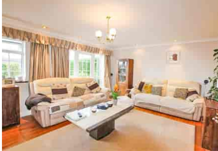
Camberley Moor Lane, WESTFIELD TN354QU