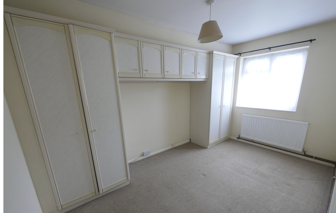
37 Beechtree Avenue, Englefield Green, Egham, Surrey TW20 0TD £209,950 - Leasehold