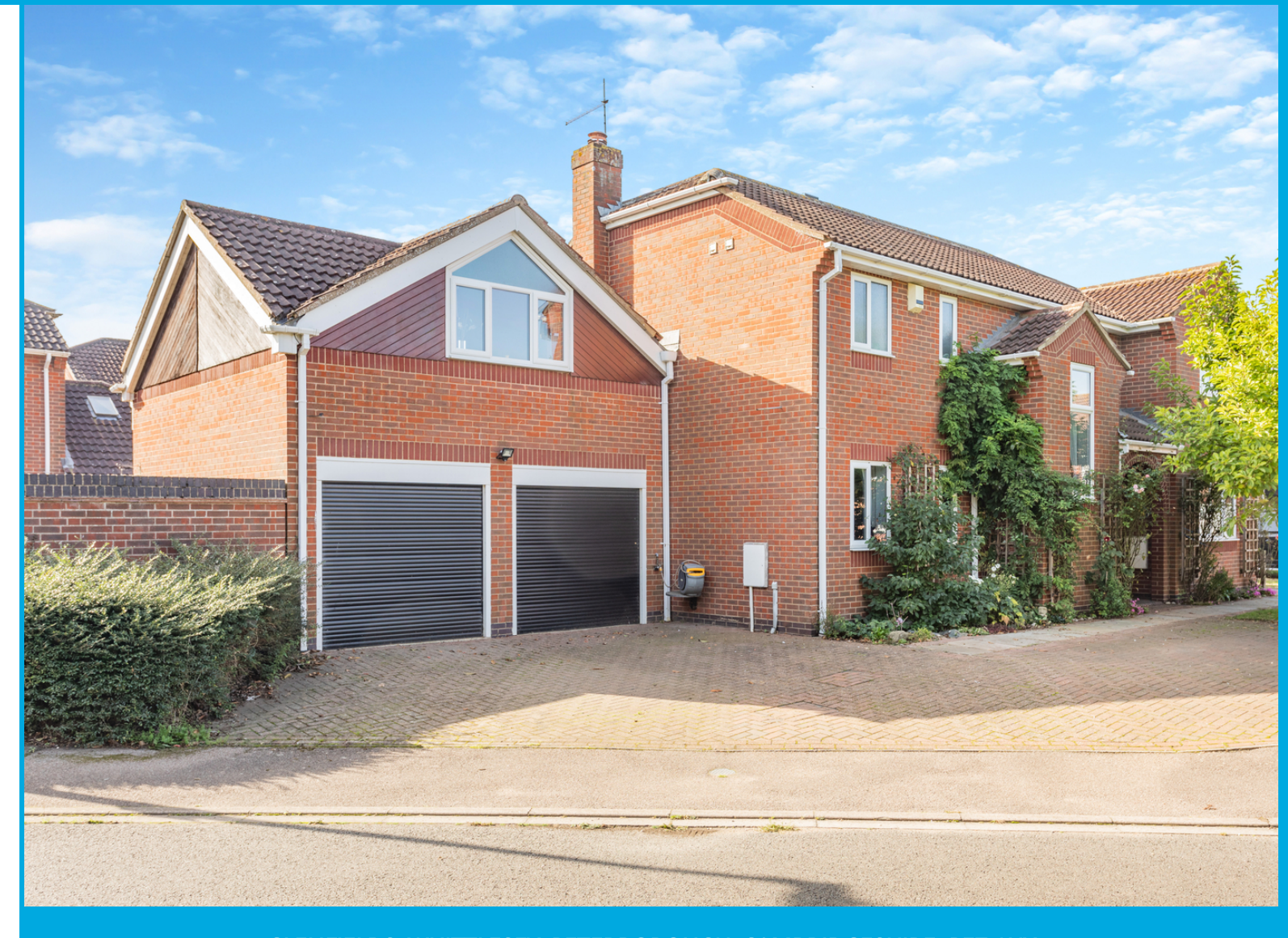
GLENFIELDS, WHITTLESEY, PETERBOROUGH, CAMBRIDGESHIRE. PE7 1HX