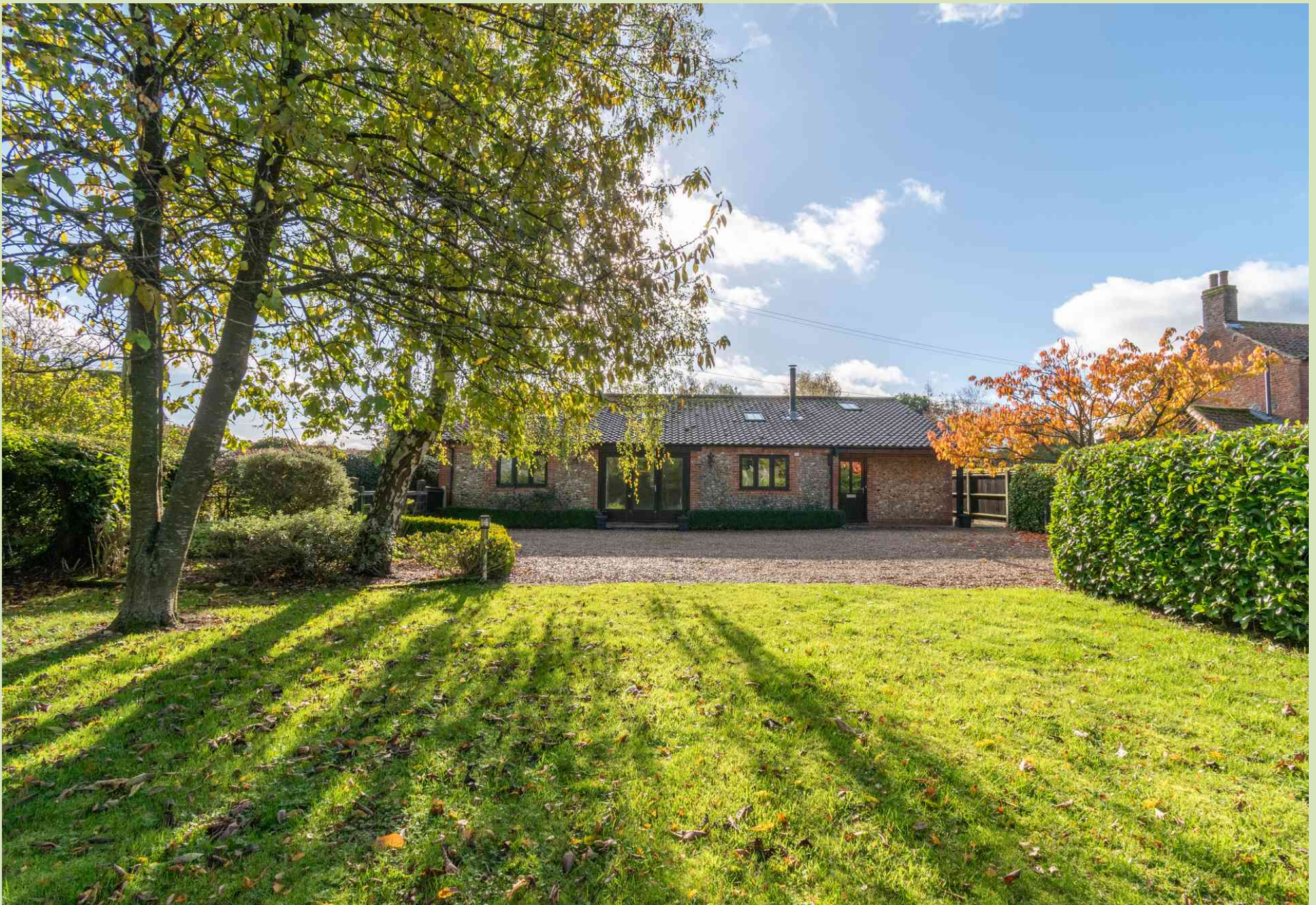
Langmoor Barn, Homingtoft Guide Price £675,000