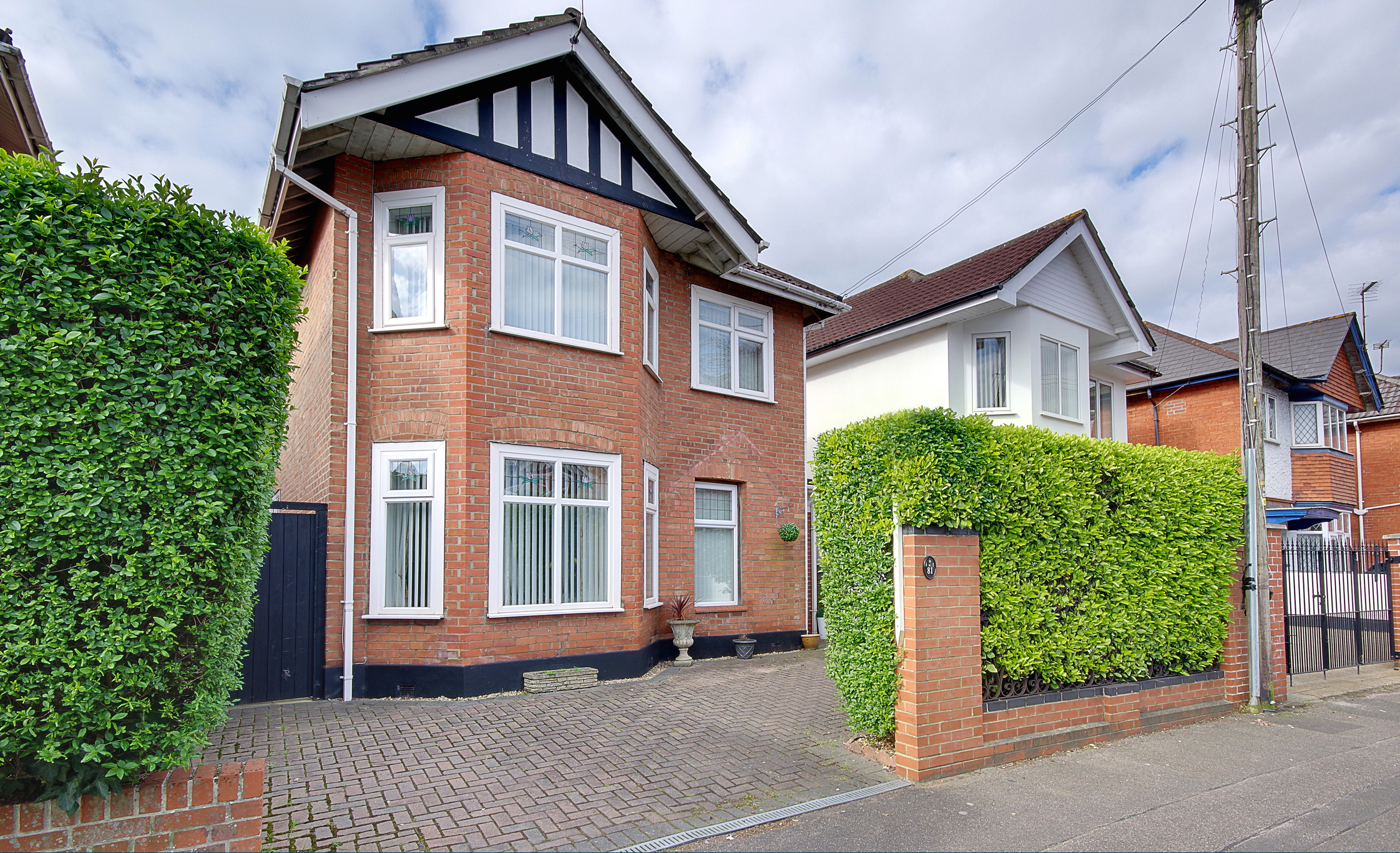
GROUND FLOOR 834 sq.ft. (77.4 sq.m.) approx.