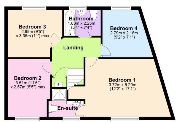
Total area: approx. 143.4 sq. metres (1543.4 sq. feet)

Approx. 57.9 sq. metres (623.4 sq. feet)