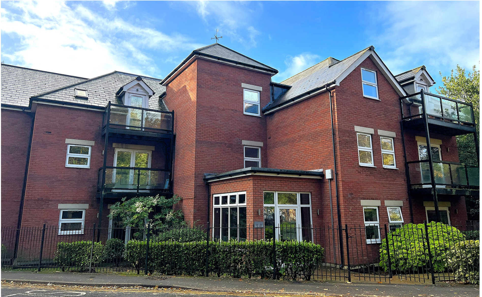
Court View, 2 Branksome Wood Road, Bournemouth BH2 6BY