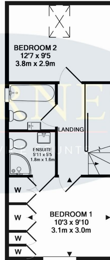
1ST FLOOR APPROX. FLOOR AREA 382 SQ.FT. (35.5 SQ.M.)

Whilst every attempt has been made to ensure the accuracy of the floor plan contained here, measurements of doors, windows, rooms and any other items are approximate and no responsibility is taken for any error, omission, or mis-statement. This plan is for illustrative purposes only and should be used as such by any prospective purchaser. The services, systems and appliances shown have not been tested and no guarantee as to their operability or efficiency can be given Made with Metropix ©2017