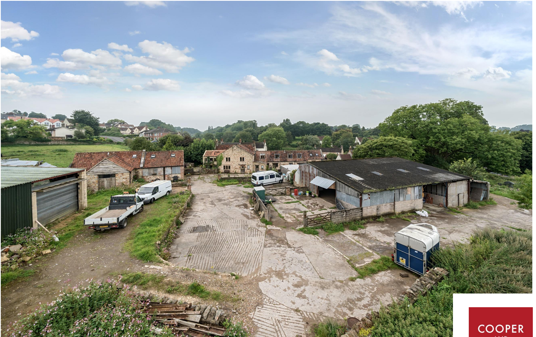
Old Norton Hall Farm, Bowden Hill, Chilcompton, BA3 4EN £1,400,000 Freehold