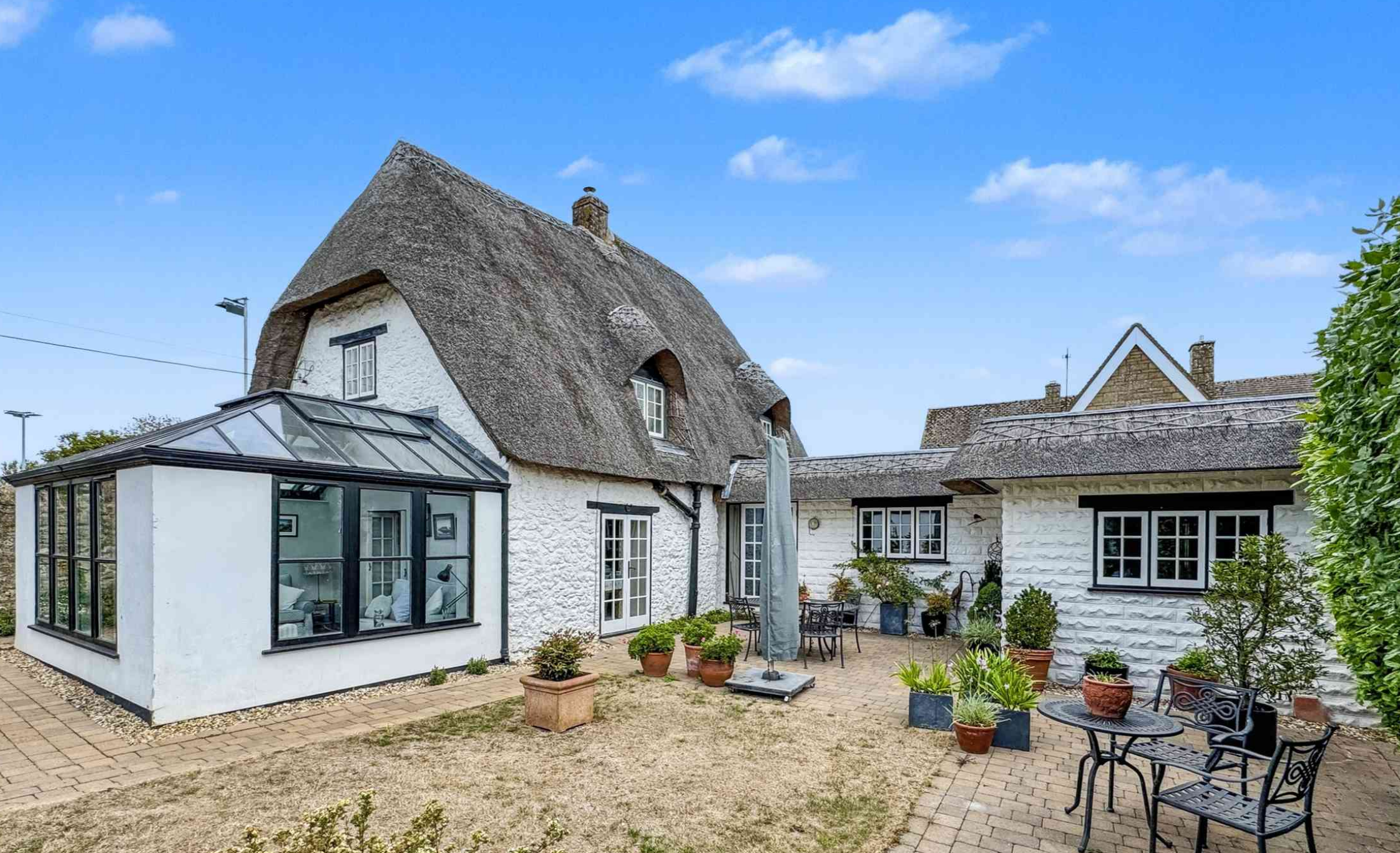
Manor Lane, Shrivenham Oxfordshire, Guide Price £750,000