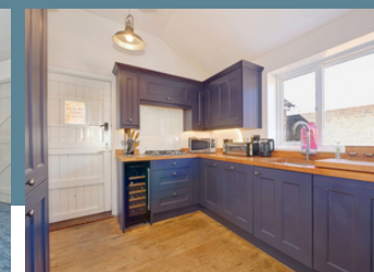
Pear Tree Cottage, Vicarage Lane, Hailsham, East Sussex BN27