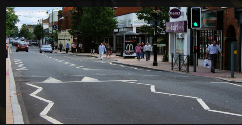
Fleet High Street