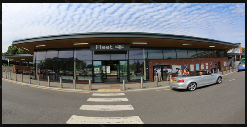
Fleet Mainline Railway Station