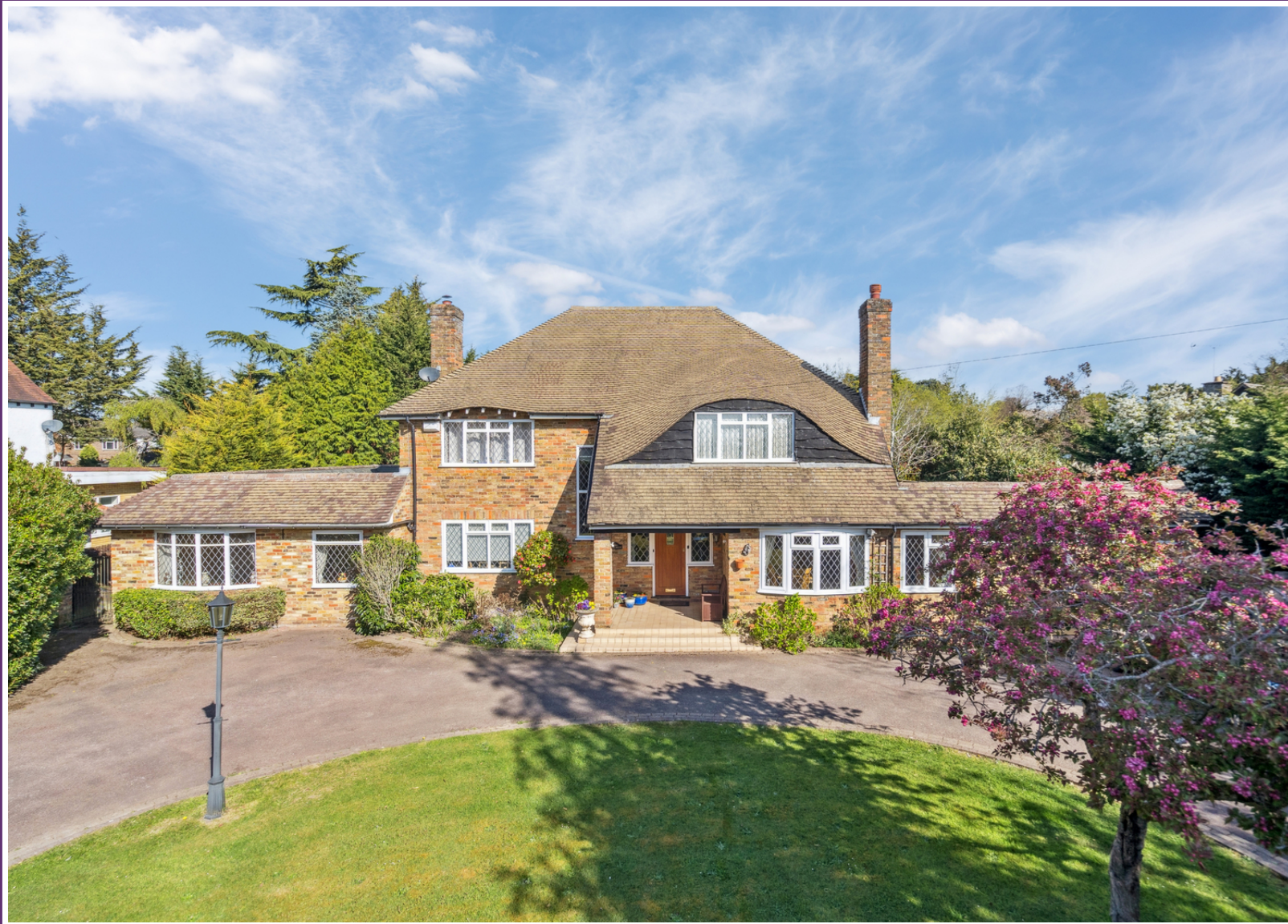
Cadena House Norwood Lane, Iver, Buckinghamshire. SL0 0EW.

HILTON KING & LOCKE SPECIALISTS IN PROPERTY