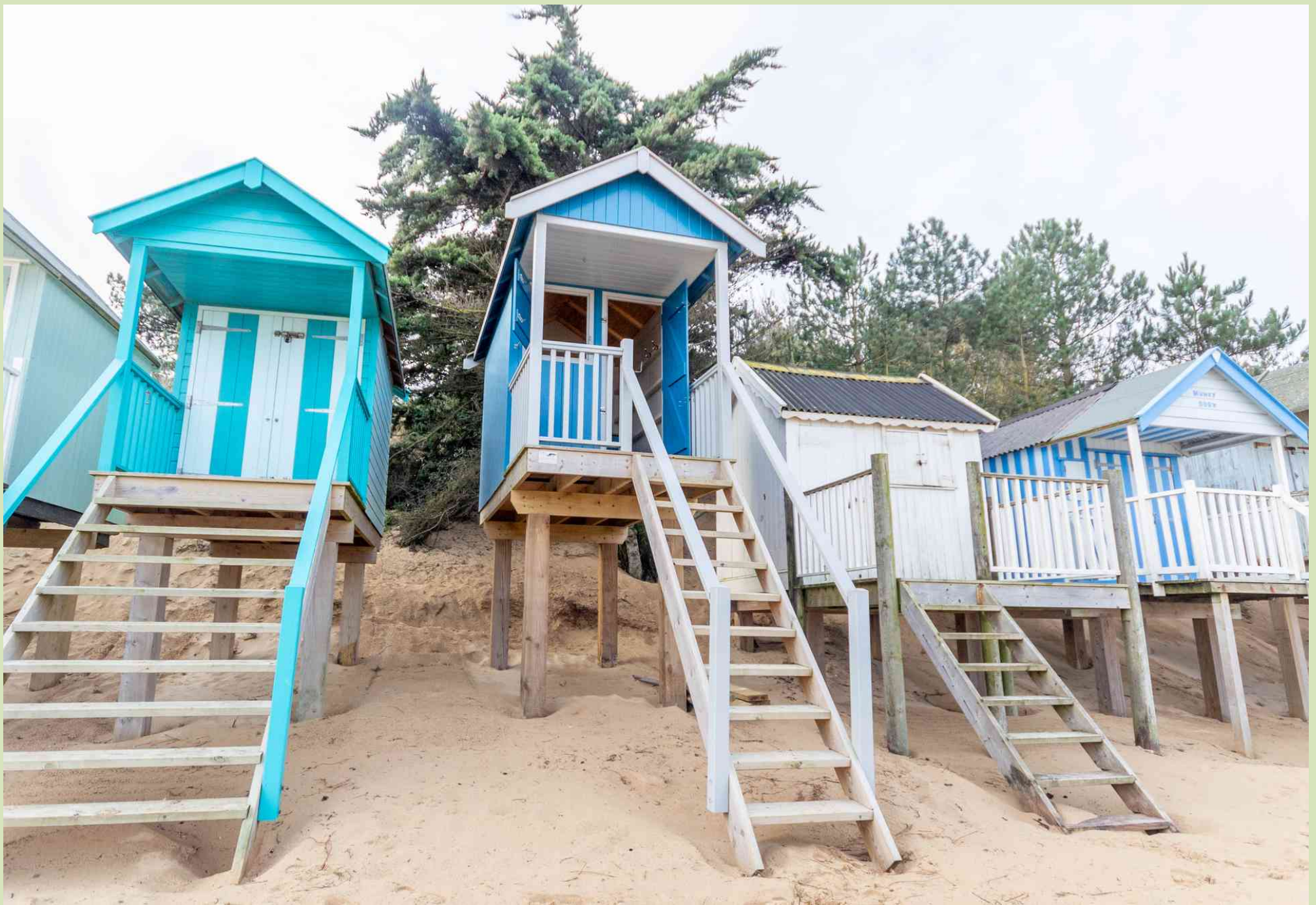
Beach Hut 72a, Wells-next-the-Sea Guide Price £83,000