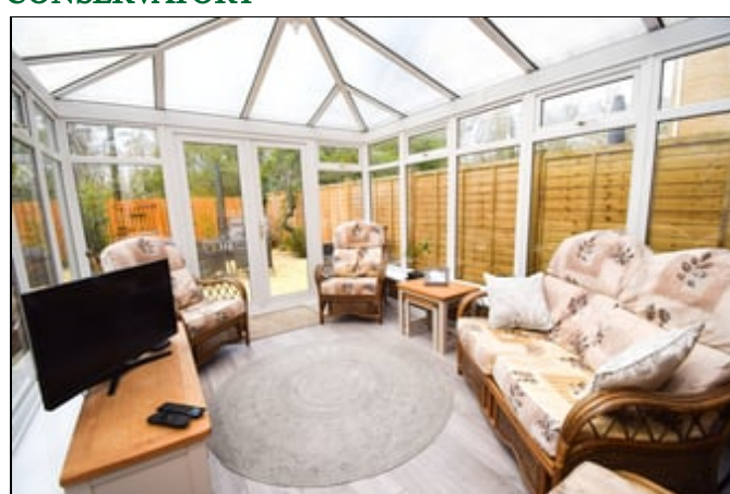
3.81m\ x\ 2.64m\ (12'\ 6"\ x\ 8'\ 8") A lovely calm and quiet space to sit and relax. Doors to garden.