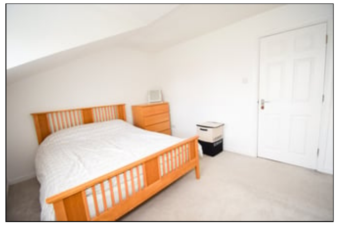
4.42m x 3.15m (14' 6" x 10' 4") Double bedroom with carpet, radiator, and a double glazed window to the rear providing fantastic views out to the lake.