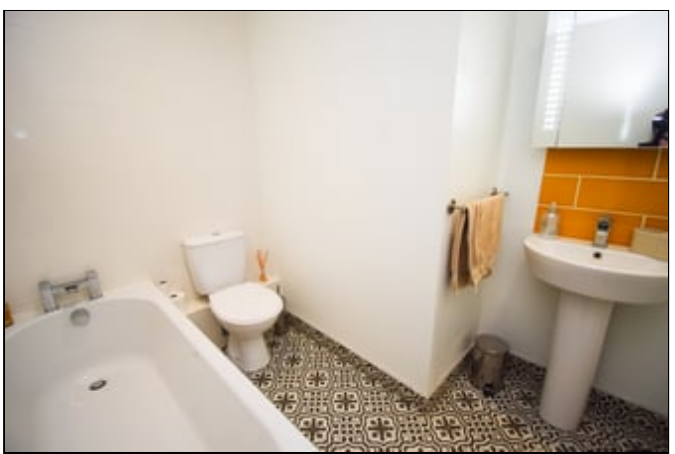
2.29m x 1.93m (7' 6" x 6' 4") Part-tiled with low level WC, a feature tiled floor, wall-mounted LED mirror, pedestal hand wash basin with tiled splash back, heated towel rail, bath.