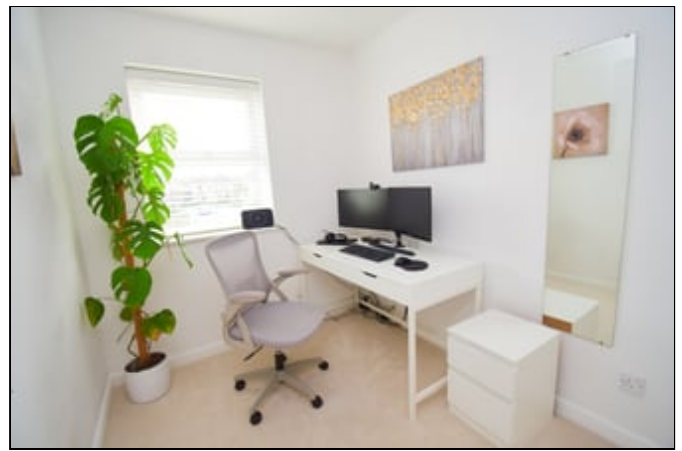
3.76m x 2.06m (12' 4" x 6' 9") Currently utilised as an office but could be a fourth bedroom. Double glazed window to front, radiator, carpet.