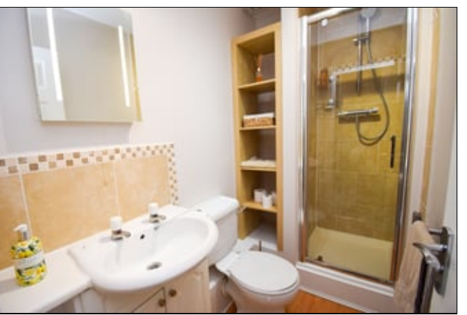
2.26m x 1.30m (7' 5" x 4' 3") Shower unit, low level WC, extractor fan, vanity unit with tiled splashback, wall-mounted LED mirror, heated towel rail, box shelving unit.